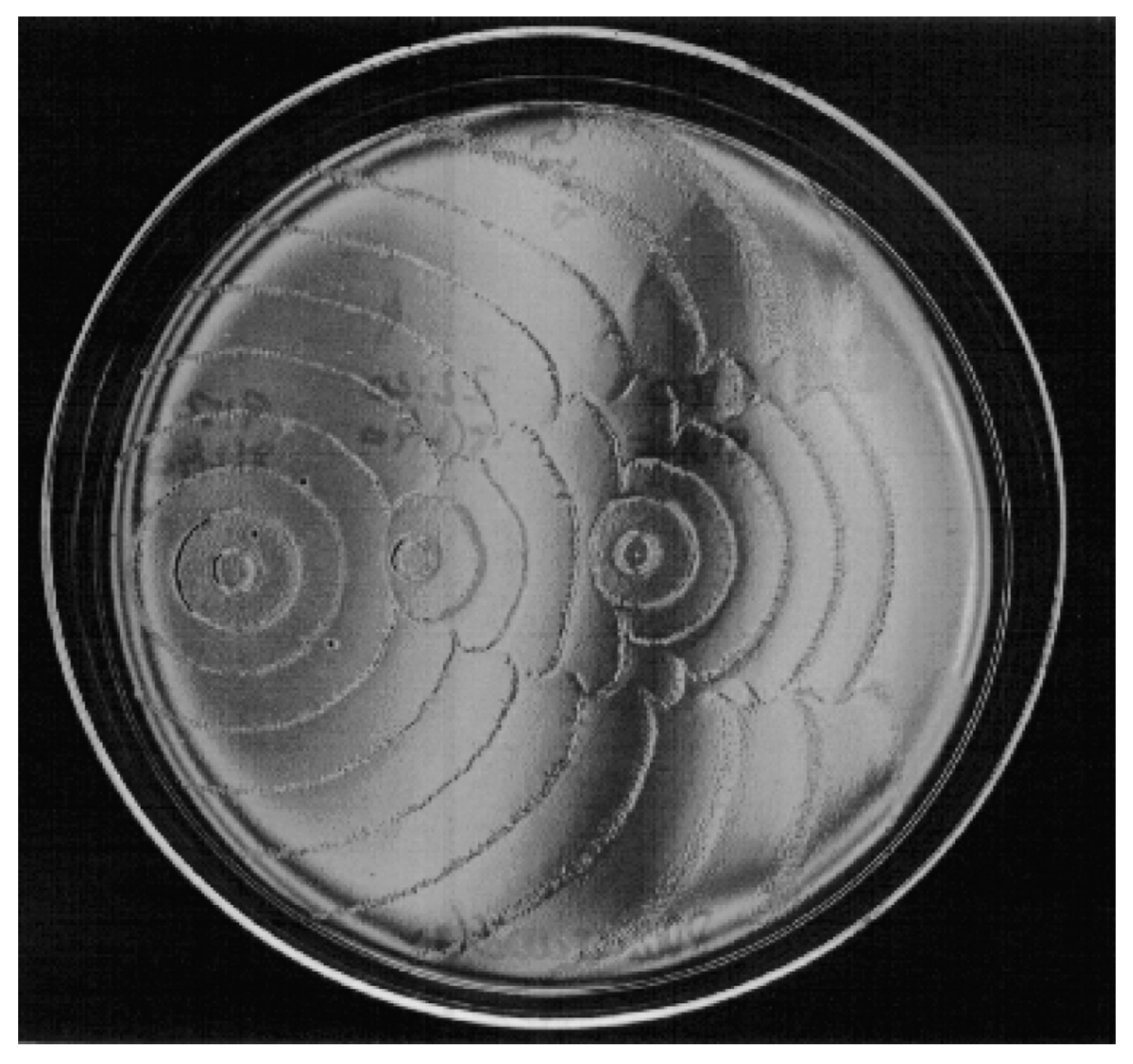
Fig. 2. Intersecting swarm colonies of Proteus mirabilis . The three spots show where the bacteria were inoculated at the start of growth (a different time for each spot). The terraces show the results of periodic spreading over the medium. The fact that the terraces do not merge when they touch indicates that periodicity results from processes internal to each colony.

adaptive howeverer, because it gives the bacteria access to additional nutrients. In other words, seeing pattern and organization in bacterial colonies tells us that bacteria engage in regulated, coordinated behaviors, even when the biological utility of group activity may be something quite different from colony morphogenesis.