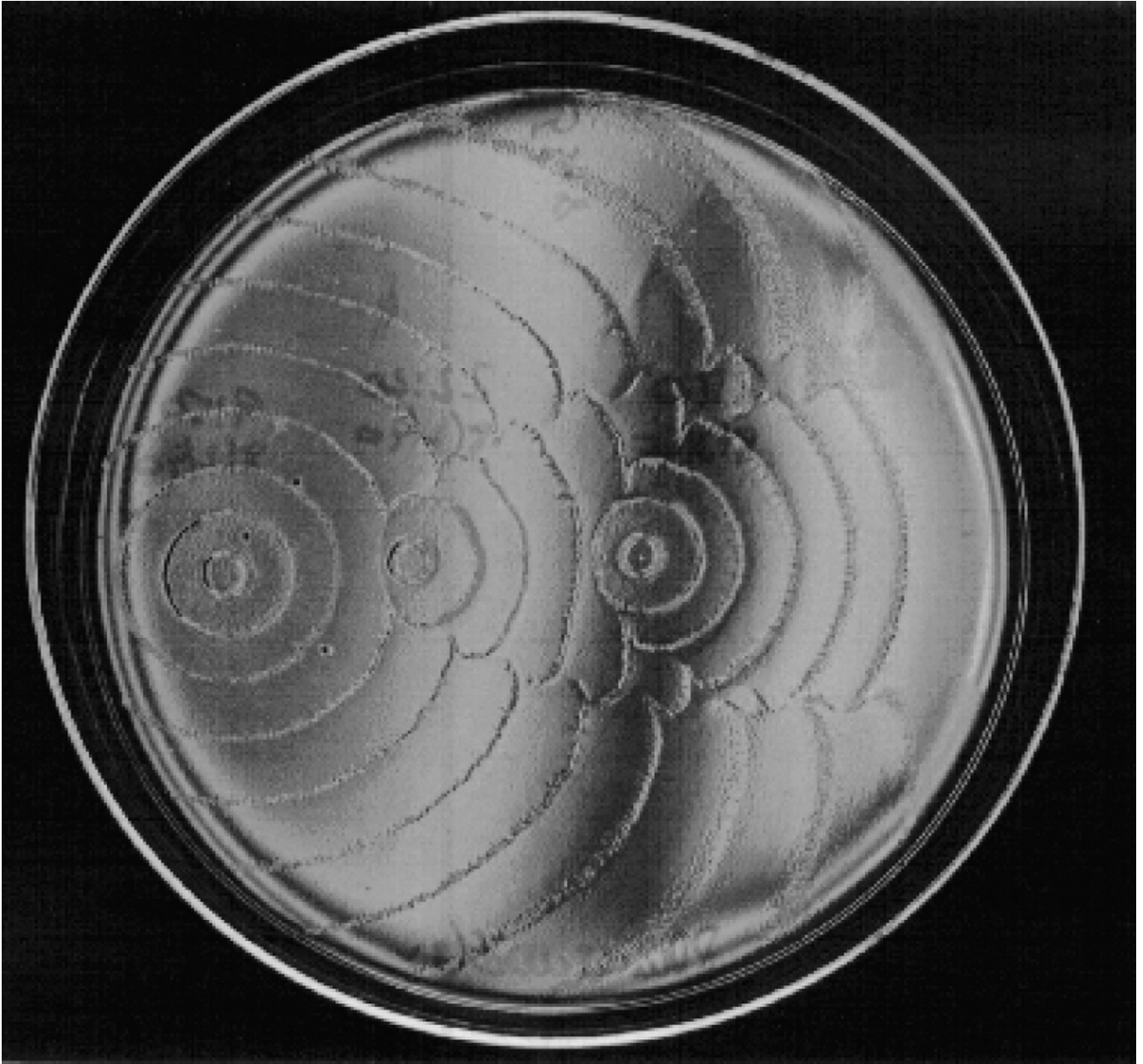
Fig. 2. Intersecting swarm colonies of Proteus mirabilis . The three spots show where the bacteria were inoculated at the start of growth (a different time for each spot). The terraces show the results of periodic spreading over the medium. The fact that the terraces do not merge when they touch indicates that periodicity results from processes internal to each colony.

adaptive however, because it gives the bacteria access to additional nutrients. In other words, seeing pattern and organization in bacterial colonies tells us that bacteria engage in regulated, coordinated behaviors, even when the biological utility of group activity may be something quite different from colony morphogenesis.