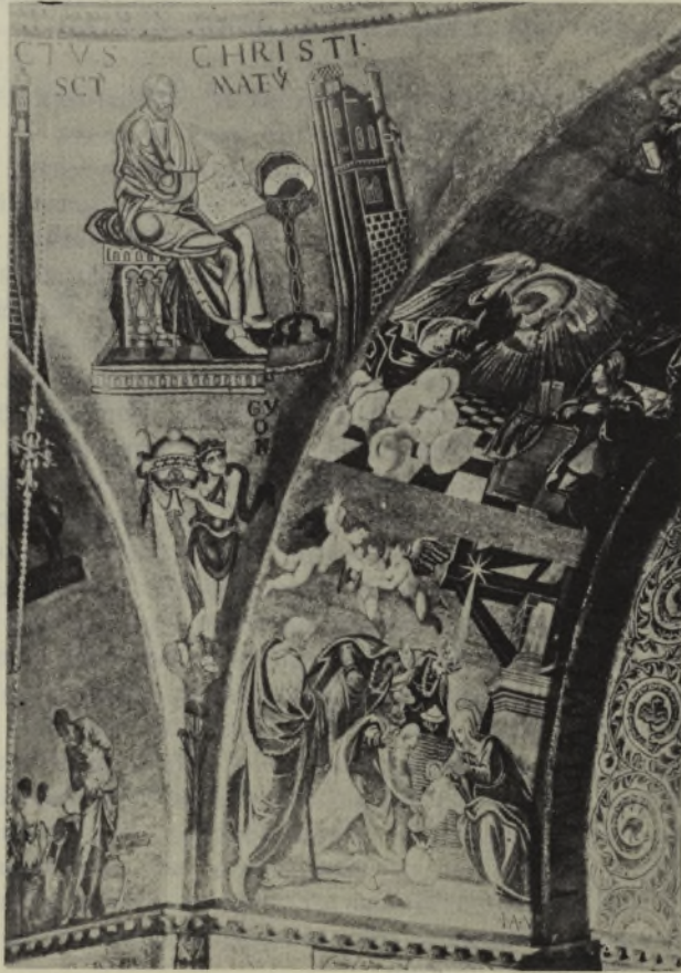
FIGURE 1. One of the four spandrels of St Mark's; seated evangelist above, personification of river below.

The design is so elaborate, harmonious and purposeful that we are tempted to view it as the starting point of any analysis, as the cause in some sense of the surrounding architecture. But this would invert the proper path of analysis. The