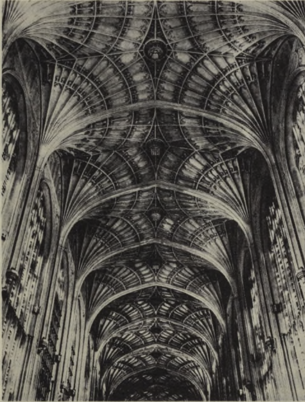
FIGURE 2. The ceiling of King's College Chapel.

the Tudor rose and portcullis. In a sense, this design represents an 'adaptation', but the architectural constraint is clearly primary. The spaces arise as a necessary by-product of fan vaulting; their appropriate use is a secondary effect. Anyone who tried to argue that the structure exists because the alternation of rose and portcullis makes so much sense in a Tudor chapel would be inviting the same ridicule that Voltaire heaped on Dr Pangloss: 'Things cannot be other than they